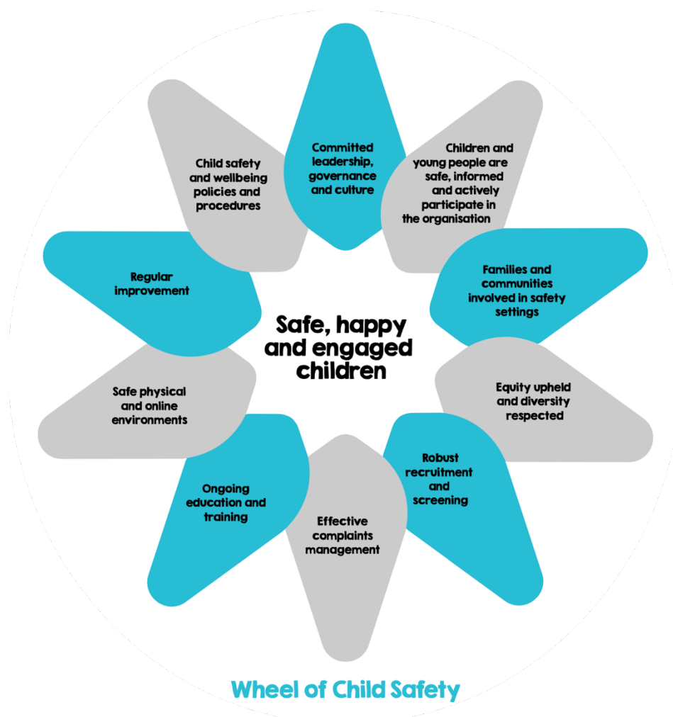
Image: National Principles for Child Safety