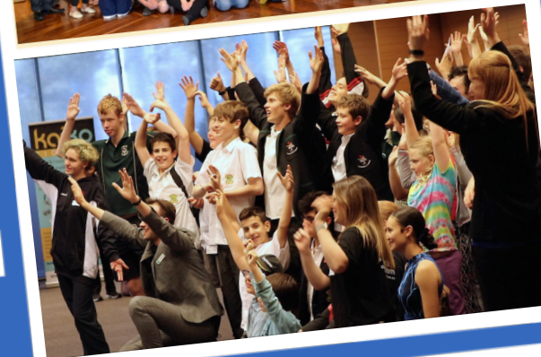
Top: The I CAN staff at the 2024 expo. Second: The foyer of our first online expo. Third: Our first ever expo in 2015. Fourth: Our first expo at ANZ Docklands, Melbourne.