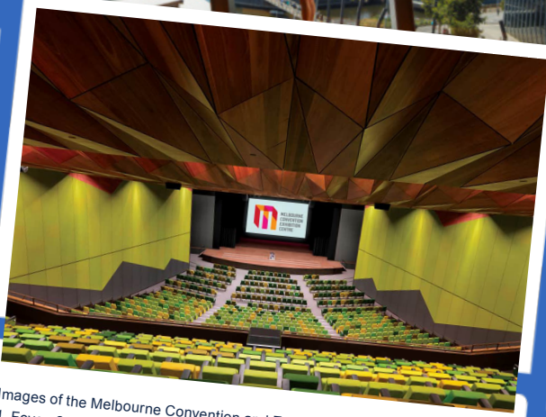
Images of the Melbourne Convention and Exhibition Centre MCEC: 1. Foyer, 2. Large Meeting Room, 3. Foyer View, 4. Plenary.